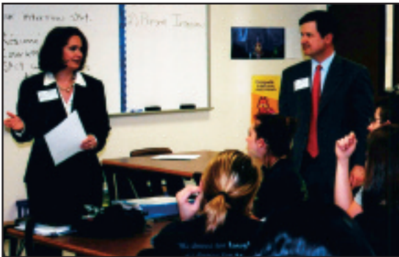
Attorneys and judges led discussions during the Dialogue on Youth and Justice .