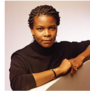
Annette Gordon Reed , professor, New York Law School; author, Thomas Jefferson and Sally Hemings: An American Controversy