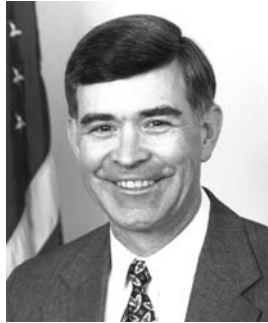
David E. Skaggs , Executive Director of the Center for Democracy & Citizenship Program at the Council for Excellence in Government; Of Counsel to Washington-based Hogan & Hartson LLP; former U.S. Congress Member (Colorado)