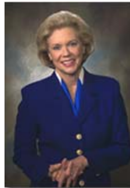
Hon. Marjorie O. Rendell , U.S. Court of Appeals (Third Circuit); First Lady of the Commonwealth of Pennsylvania