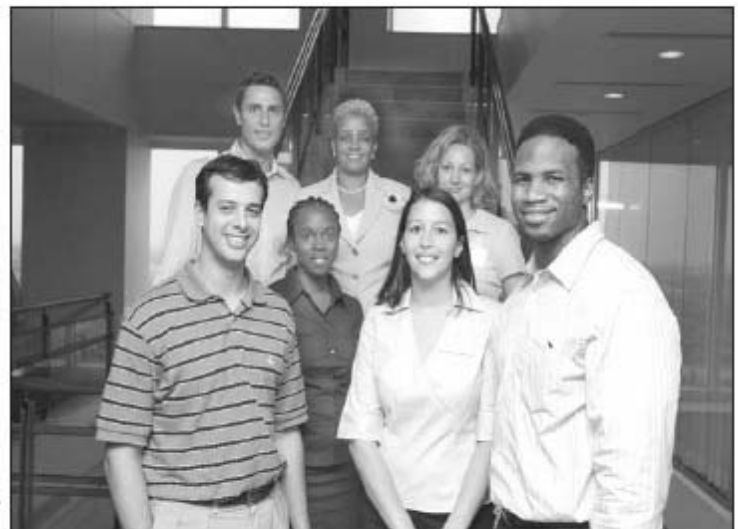
2004 President's Awardee, Mayor Shirley Franklin of Atlanta, with Guests at the Annual Meeting President's Reception in Atlanta, Georgia

Firms Must Address Perceptions of Gender Bias