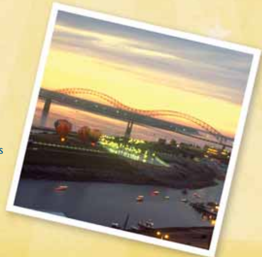
De Soto Bridge, Memphis