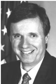
Timothy J. Muris

We present here as two separate articles the edited version of the Question and Answer portion of the Chicago session, and the full program from the Antitrust Section Post-Annual Meeting in Colorado Springs. We found the enforcers' comments to be an interesting and refreshingly informal window into their early thoughts on assuming the leadership of the U.S. government antitrust agencies.