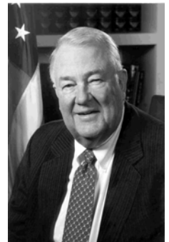
Hon. Edwin Meese, III

Hon. Edwin Meese, III , Former U.S. Attorney General, Washington, DC