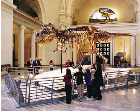
The Field Museum